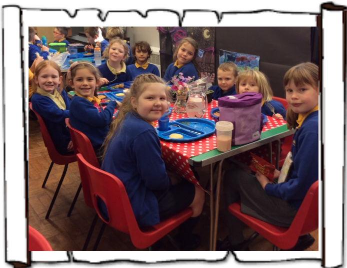
Star pupils of the week